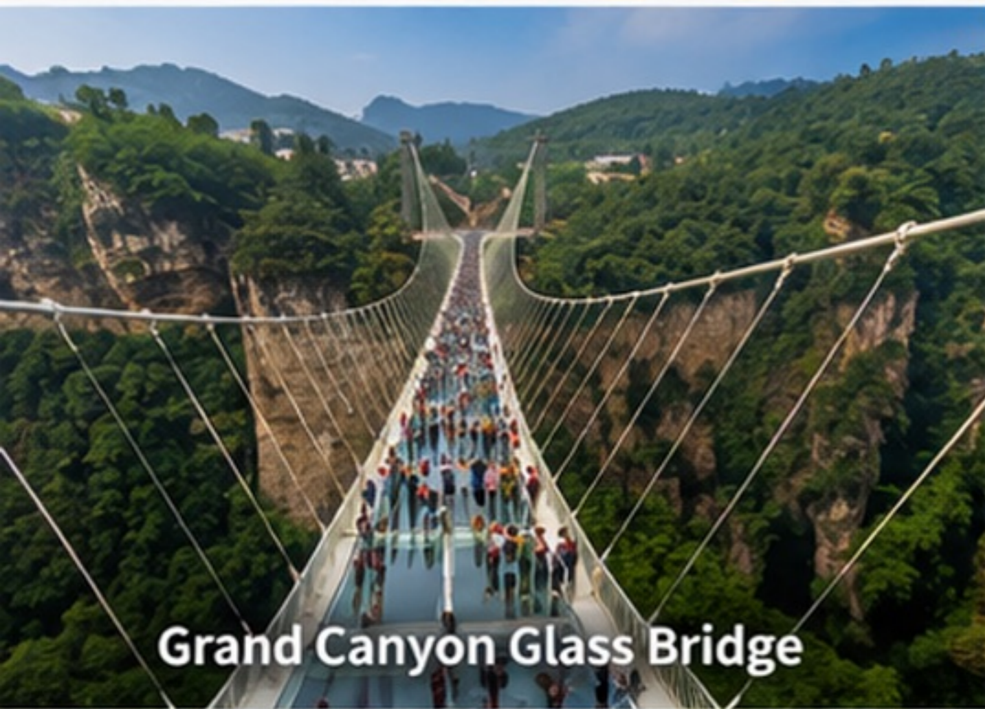
Grand Canyon Glass Bridge