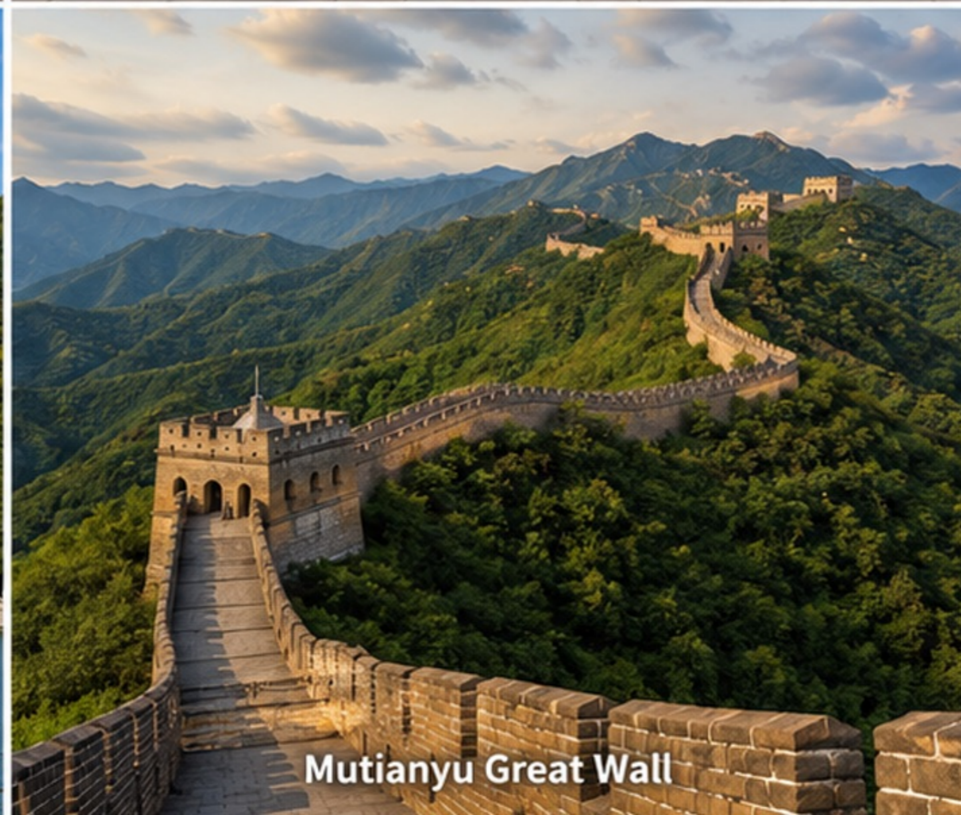
Mutianyu Great Wall