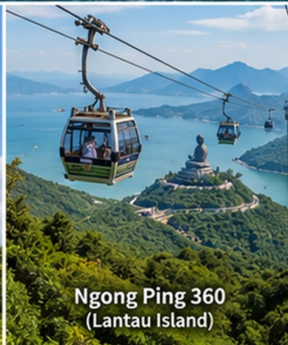
Ngong Ping 360 (Lantau Island)