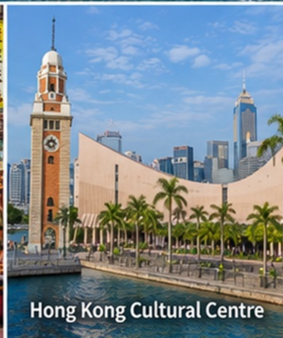
Hong Kong Cultural Centre