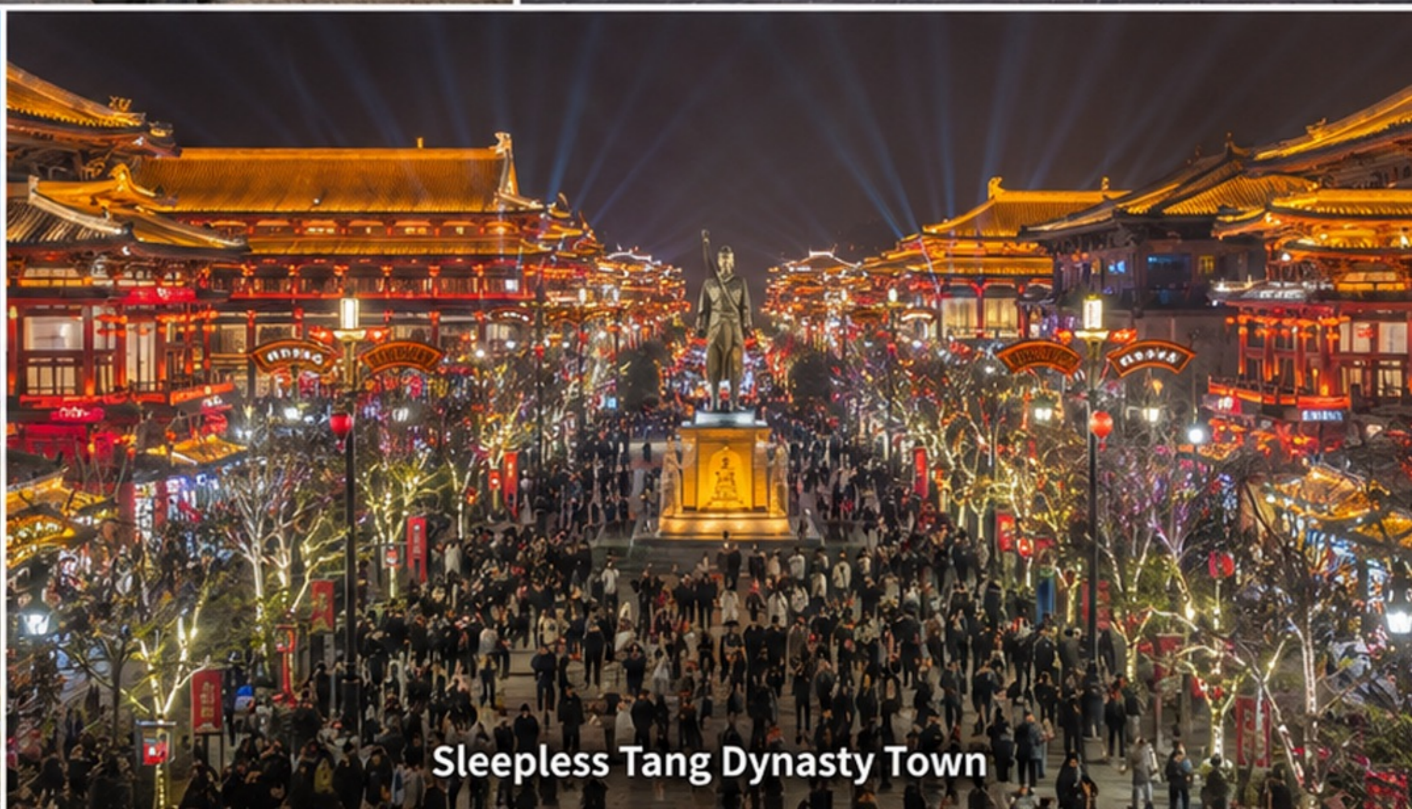
Sleepless Tang Dynasty Town