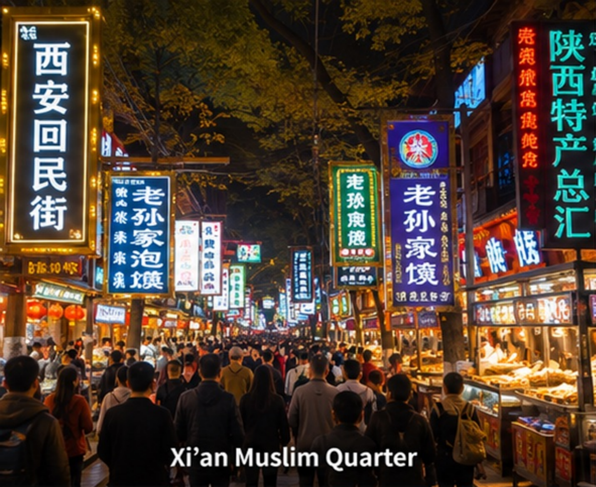
Xi'an Muslim Quarter