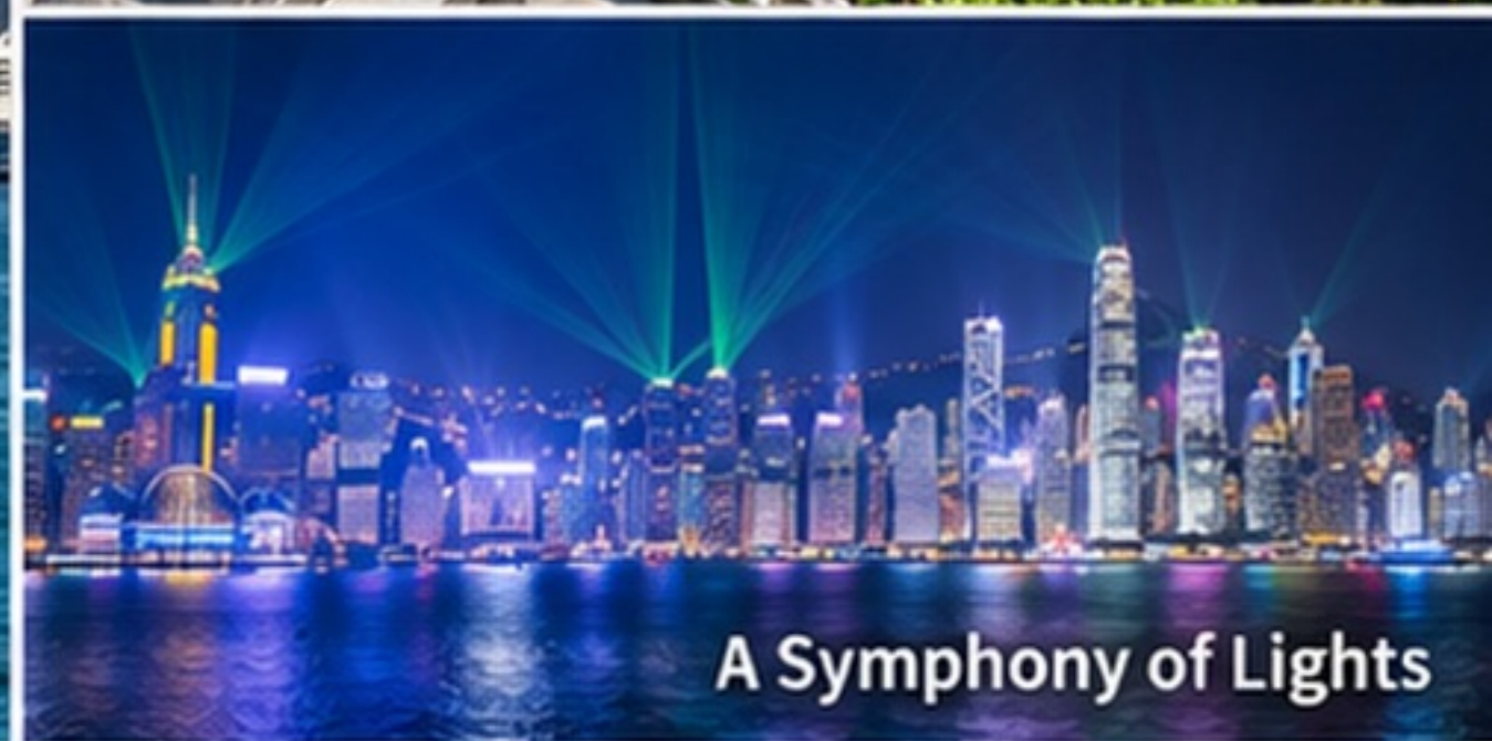
A Symphony of Lights