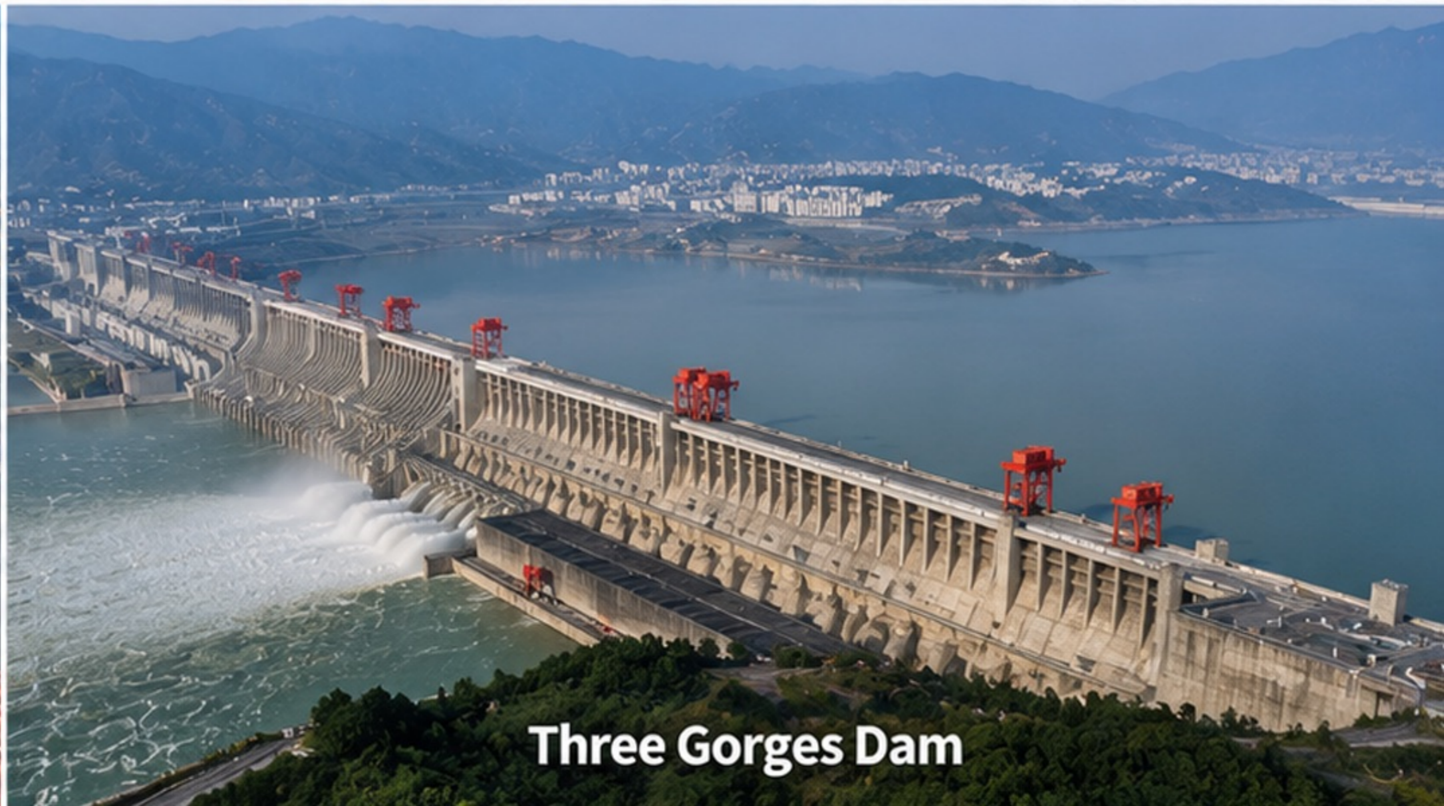
Three Gorges Dam