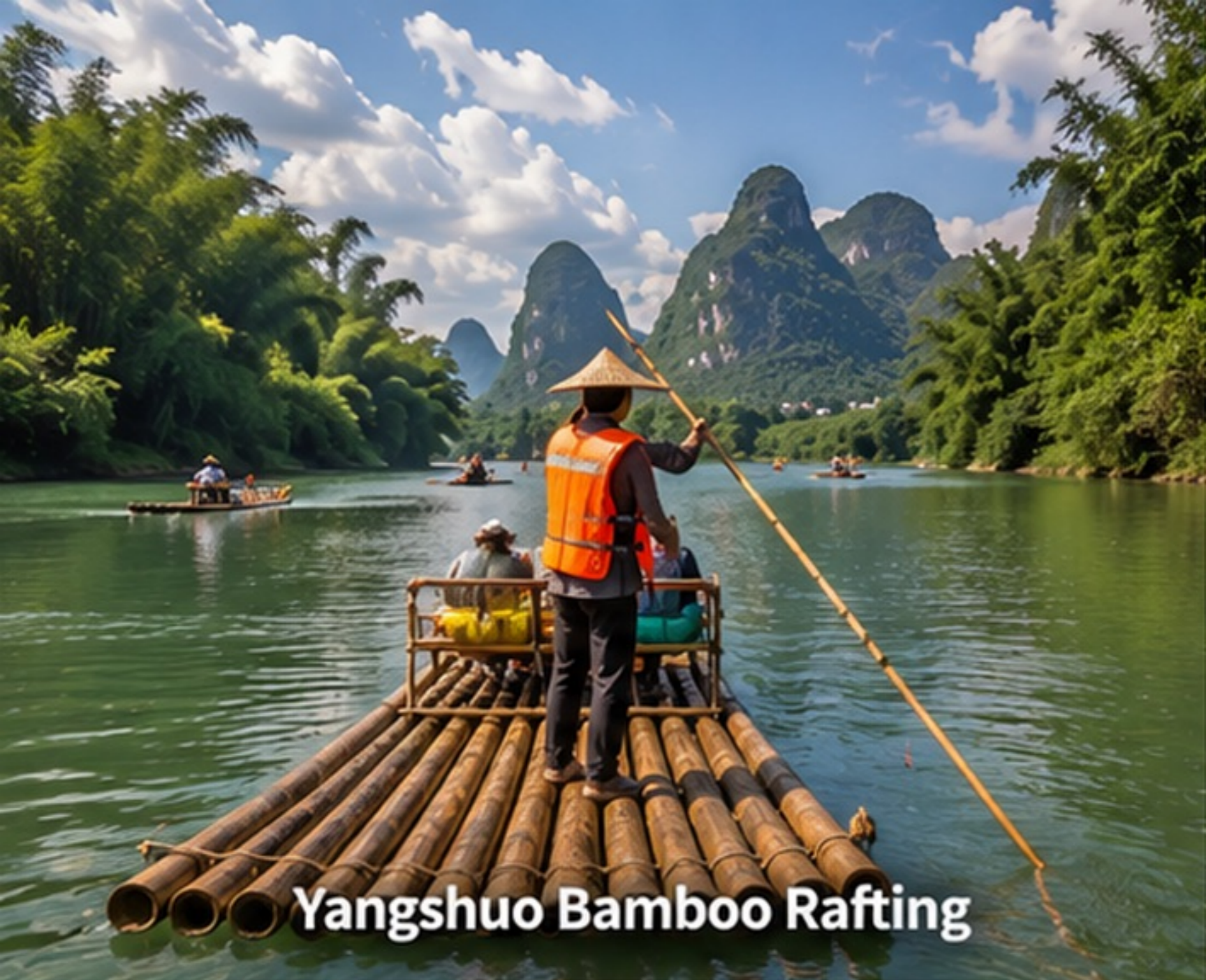
Yangshuo Bamboo Rafting