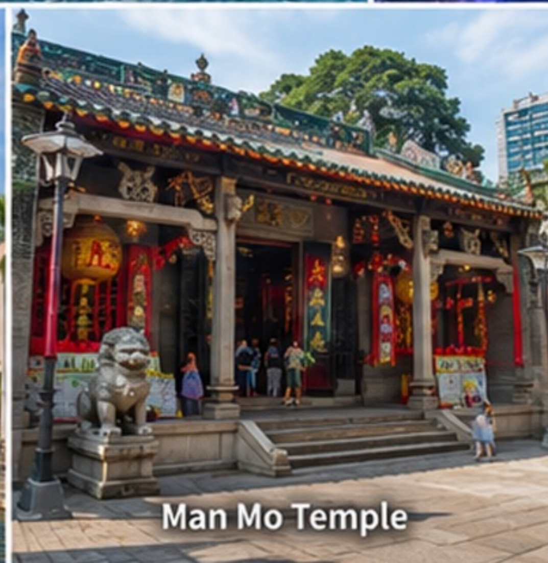
Man Mo Temple