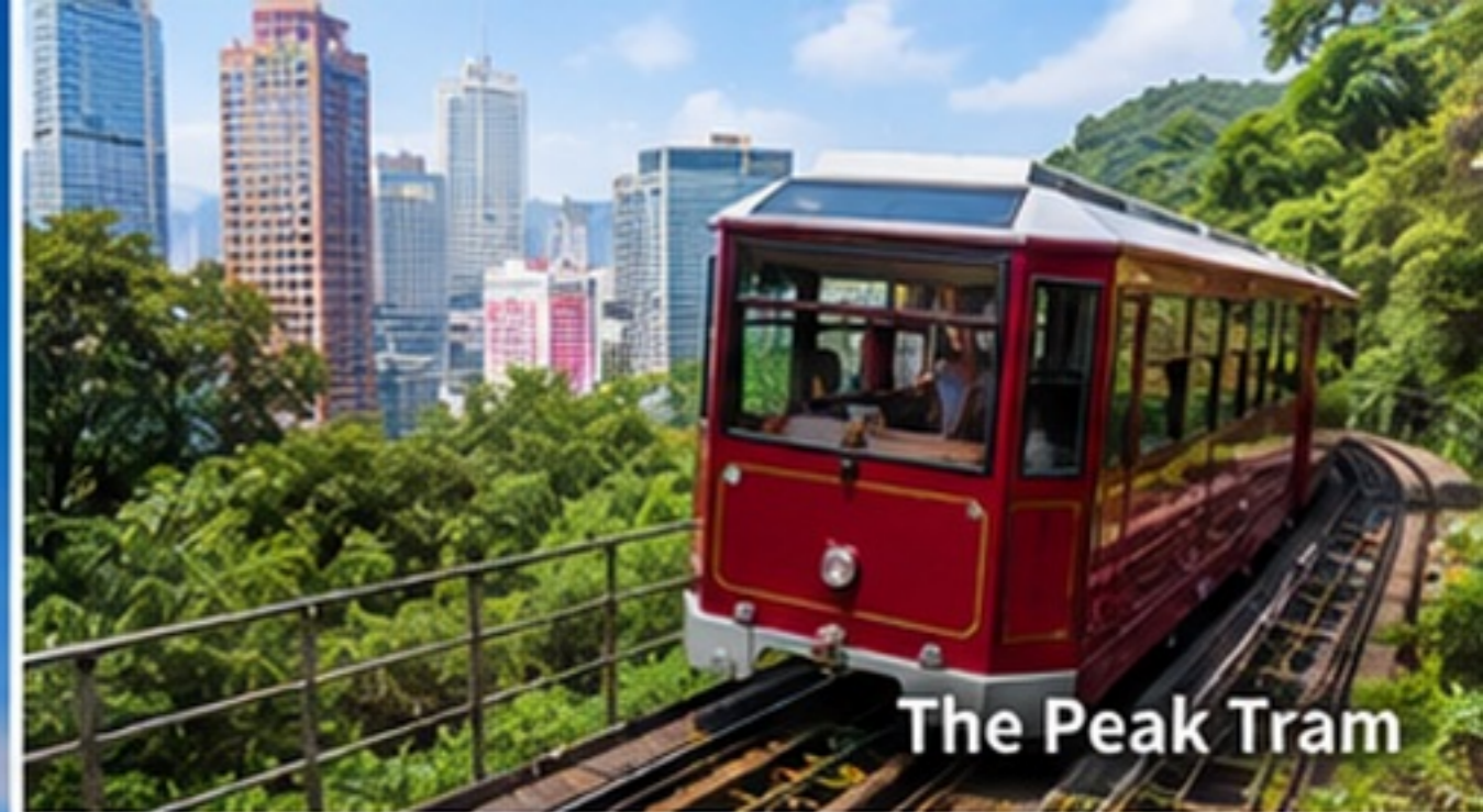
The Peak Tram