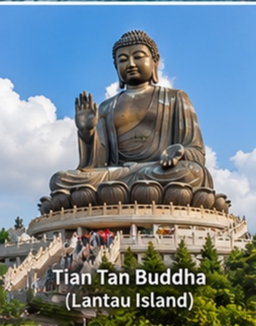
Tian Tan Buddha (Lantau Island)