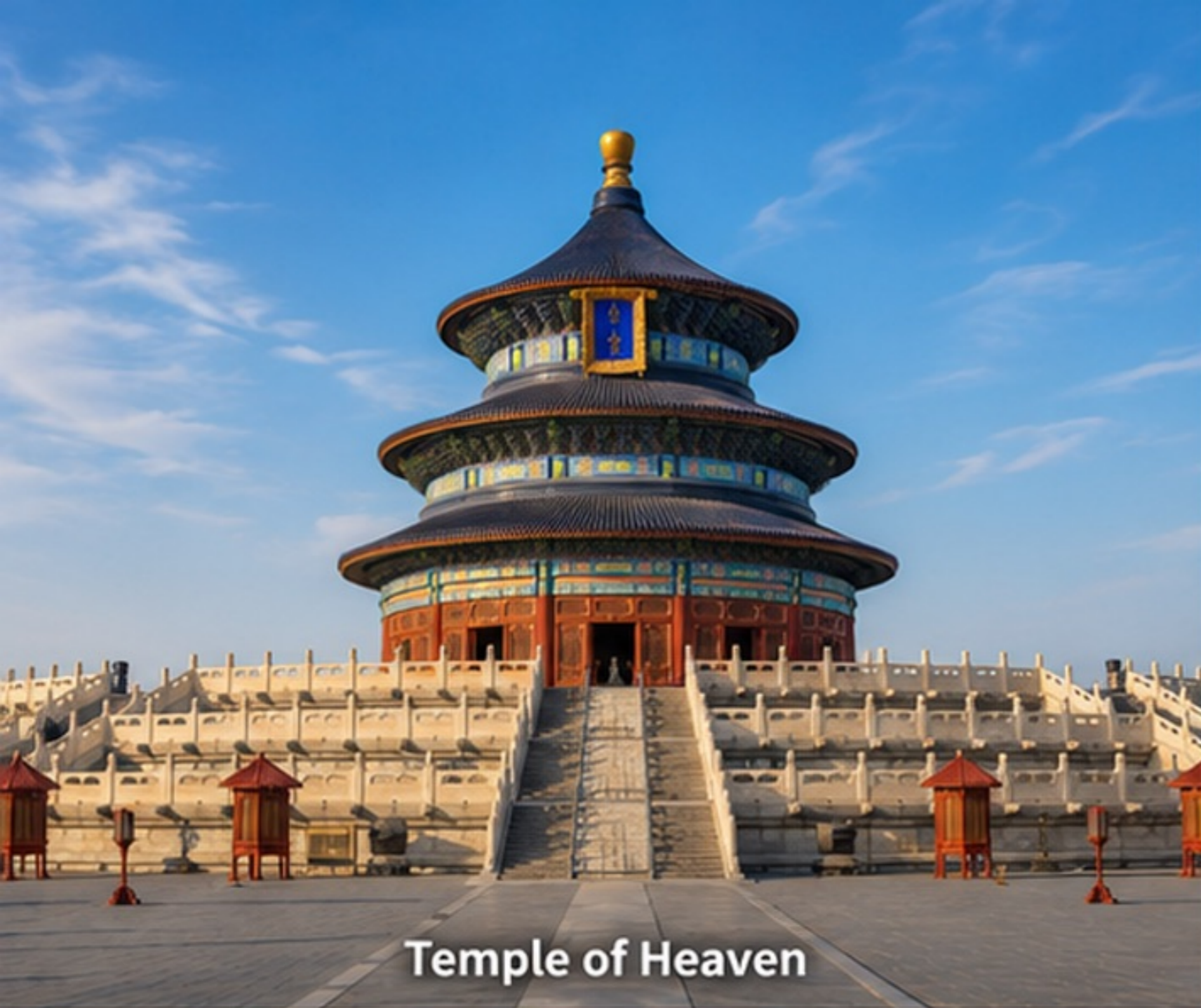
Temple of Heaven