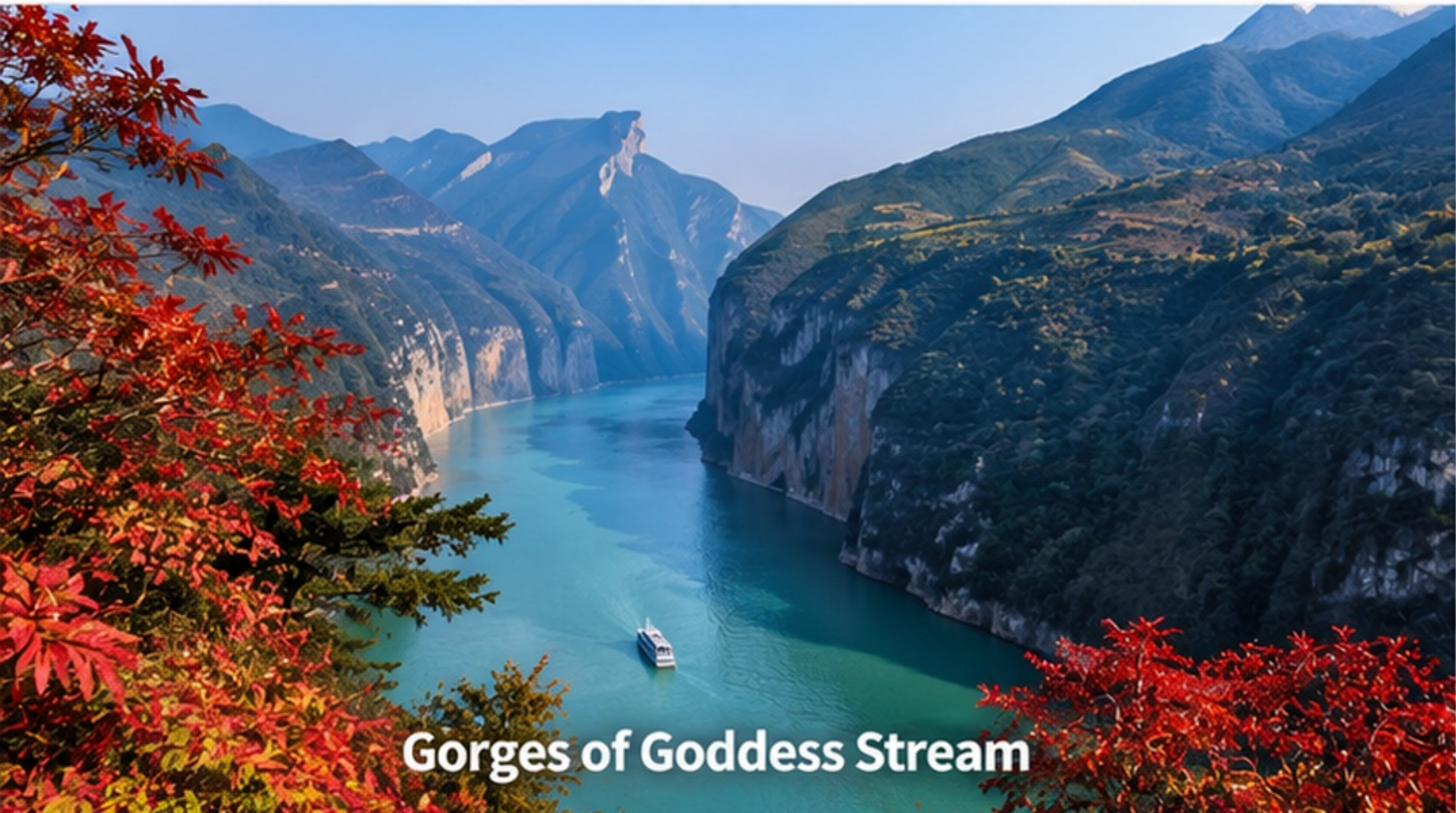
Gorges of Goddess Stream