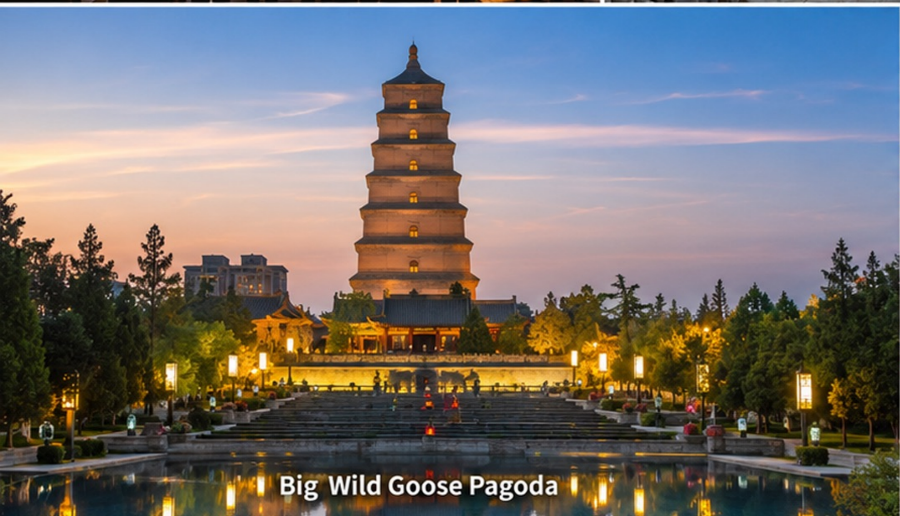
Big Wild Goose Pagoda