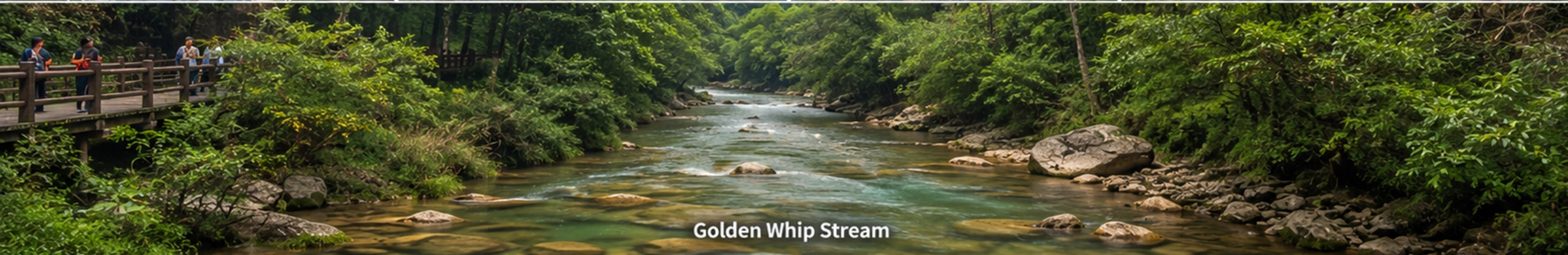
Golden Whip Stream