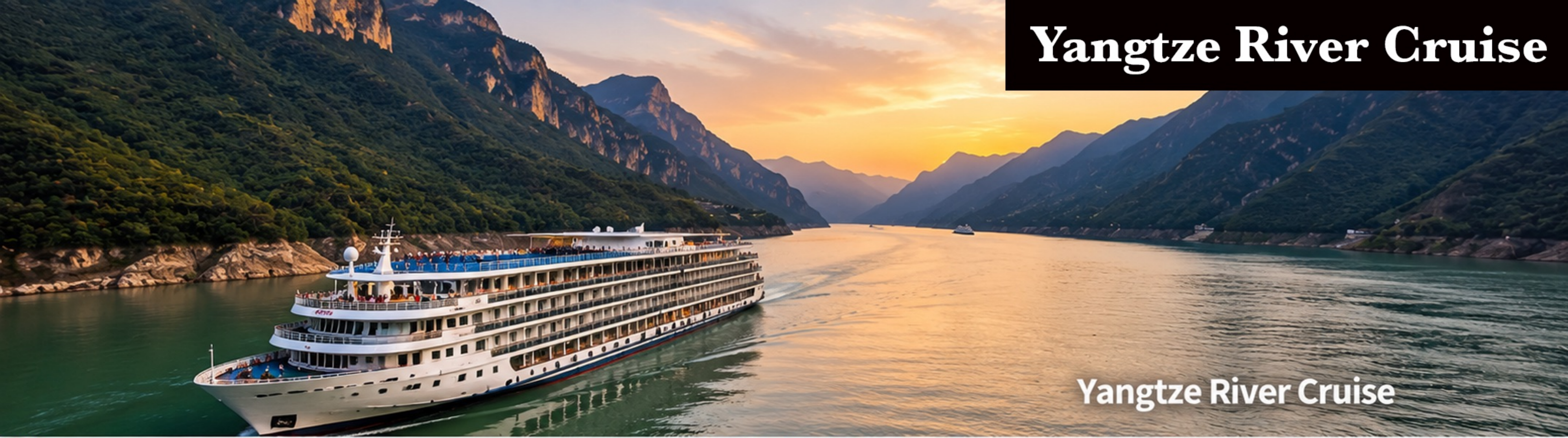
Yangtze River Cruise