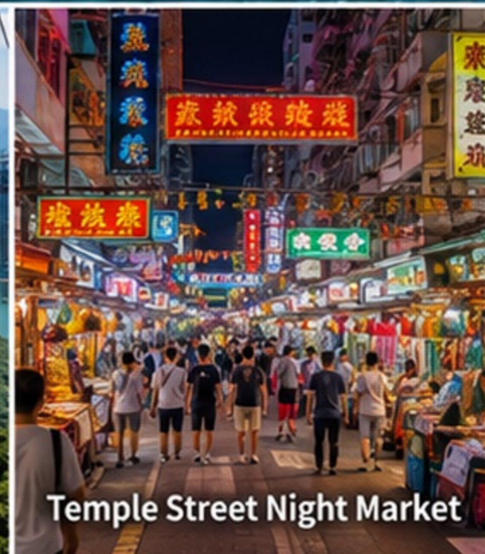
Temple Street Night Market